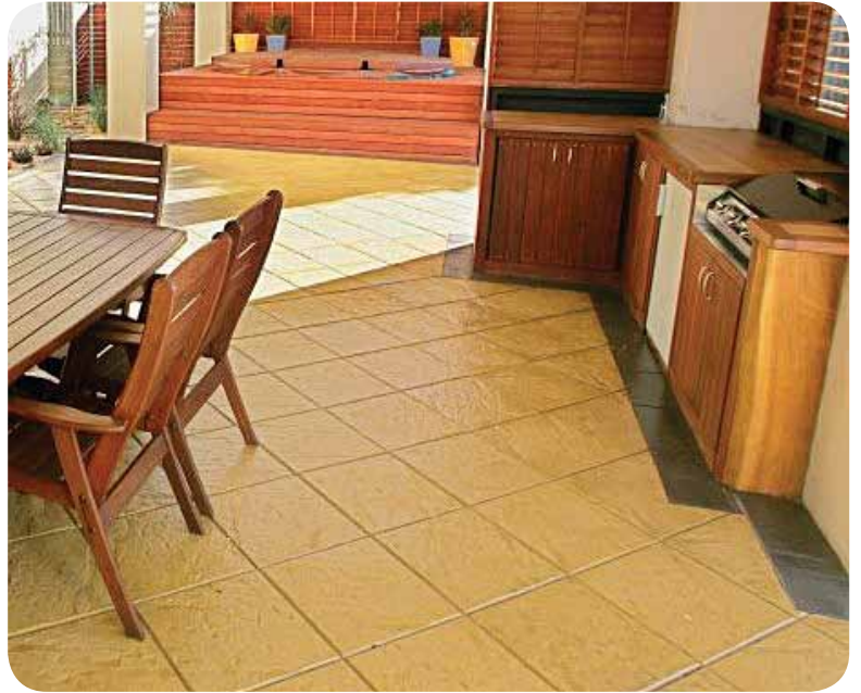
Euro Slate® Pavers