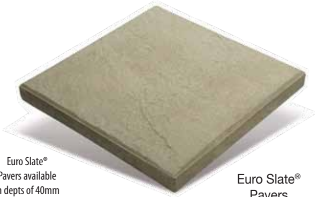
Euro Slate® Pavers available in depths of 40mm and 55mm